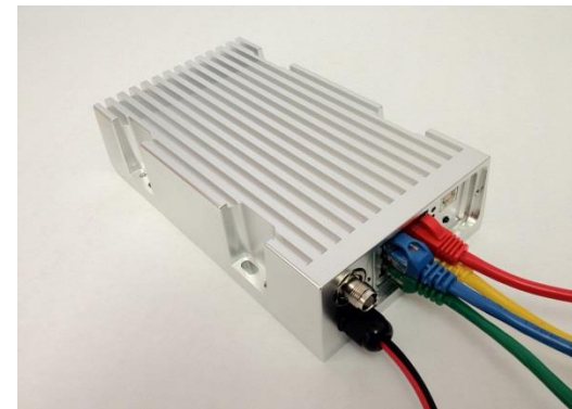
Etherstack RMU25 P25 Data Modem as used in utilities networks